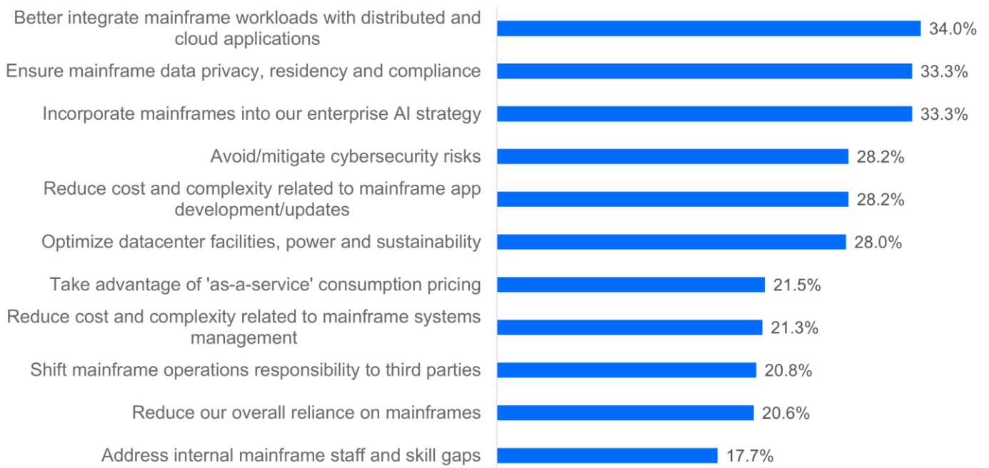
FIGURE 2: Top 3 Priorities Driving Mainframe Modernization Strategies