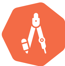
Design & implementation services